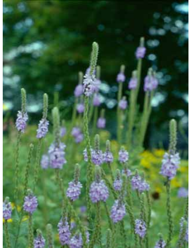
Hoary Vervain: drought-tolerant with long-lasting violet-purple blooms in summer Paul O'Hara