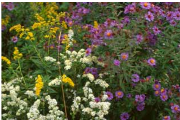
Hard meadow workers: Canada Goldenrod, Heath Aster and New England Aster.