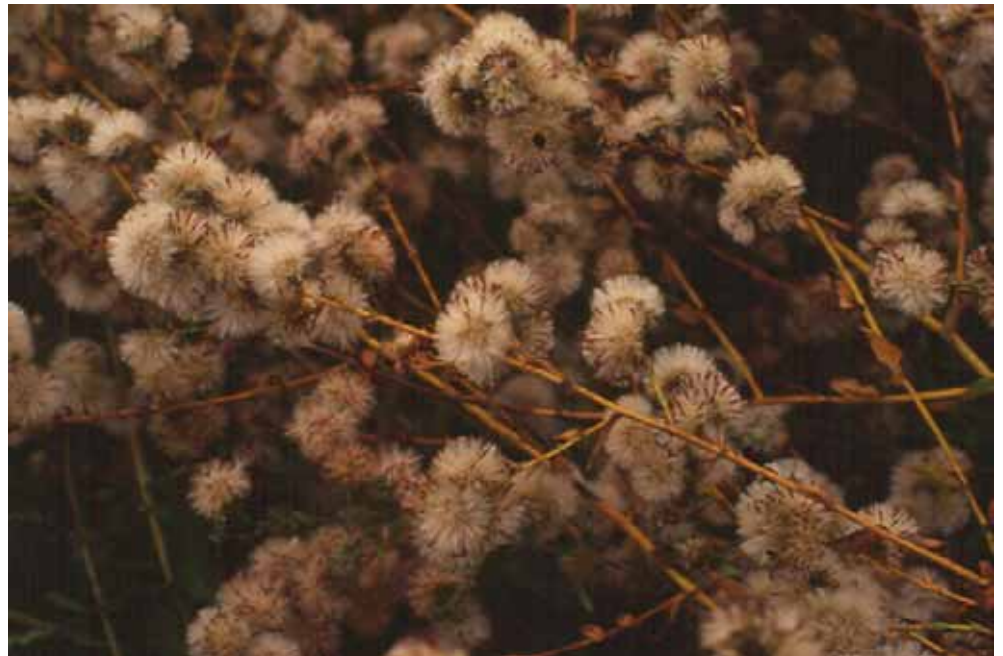
Photo above by Paul O'Hara of smooth aster seed head. You can download a copy of the Bluestem Banner IN COLOUR from www.tallgrassontario.org

Please complete the enclosed package OR go to www.tallgrassontario.org to download a copy. See you there!!! And turn to page 2 for more information about Forum 2005