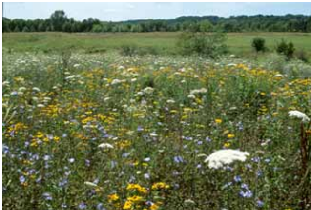
Sweet Ox-eye, Queen Anne's Lace & Chicory at Gate of Heaven Cemetery, Summer 2004

By early summer I began to think the land had different ideas. So I took off my science cap - eternally wedded to certainty, measurable results and the pursuit of general nerdiness - and took a good, hard look.