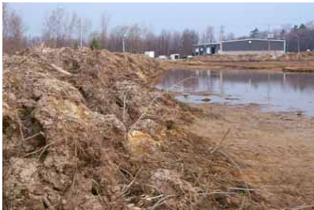
High quality Hamilton Meadow bulldozed, Fall 2004

Mentioning the plight of the Southern Ontario meadow to a knowledgeable colleague I was met with: "But meadows are everywhere." Precisely. And it is because of that fact that we must not only encourage prairie and savanna conservation, but also grassland conservation in general.