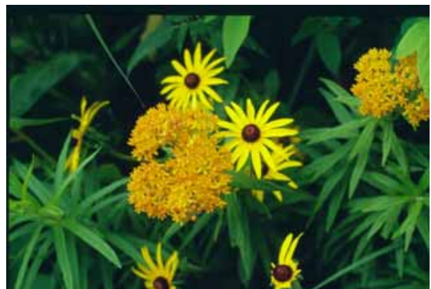
Natural garden companions: Black-eyed Susan and Butterfly Milkweed