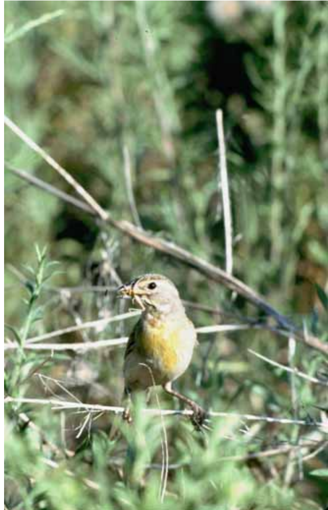
Dickcissel Spiza Americana P. Allen Woodliffe

As of early July, they had been recorded from at least six different areas of Chatham-Kent, and been confirmed as breeding with the discovery of at least two nests, one of which was situated in a well-developed clump of Virginia Mountain-mint ( Pycnanthemum virginianum ).