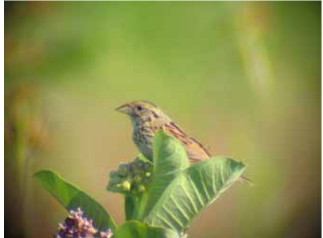
Henslow's Sparrow ( Ammodramus henslowii ) P. Allen Woodliffe

that some of these tallgrass prairie creation sites are being used by a good diversity of typical grassland birds, and occasionally by some of the rare and endangered species!