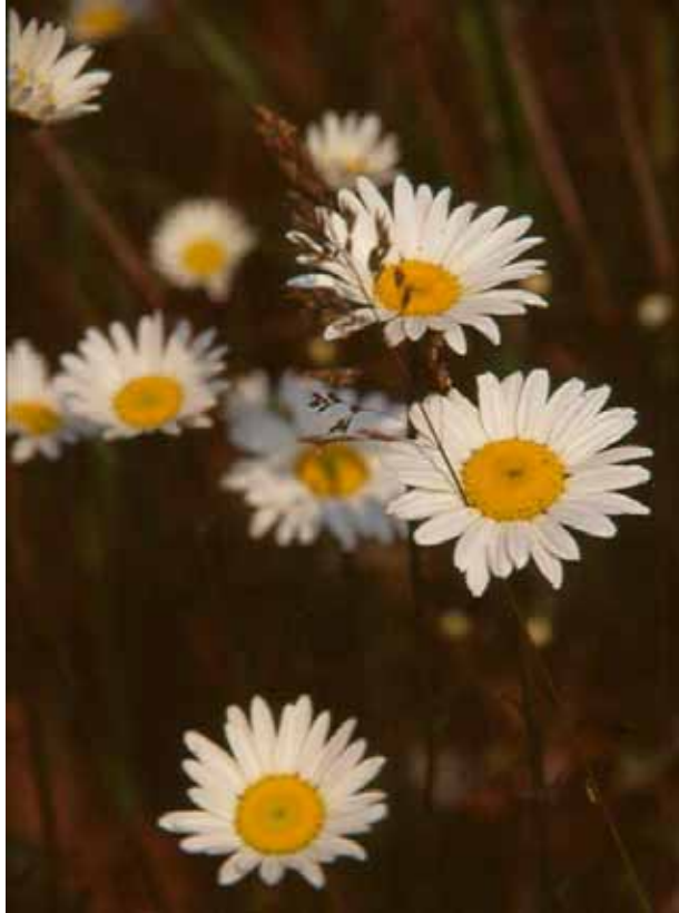
Ox-eye daisy, a beautiful weed.