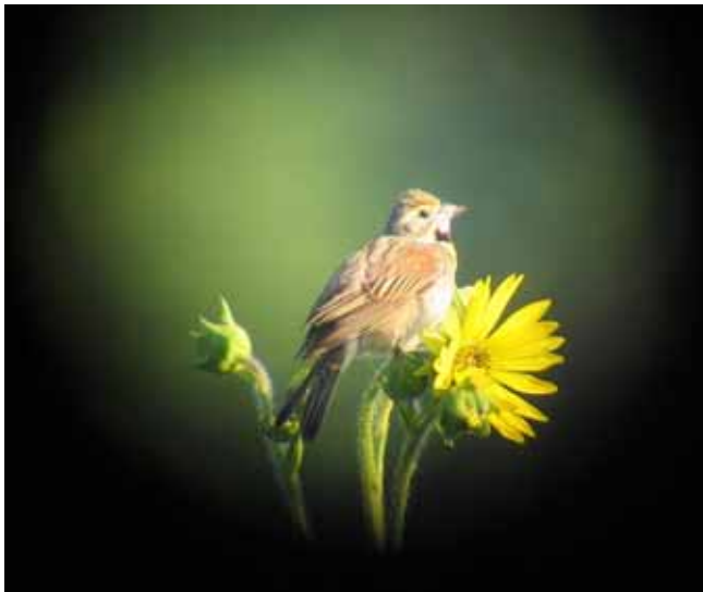
Dickcissel Spiza Americana P. Allen Woodliffe

The native grasslands of the tallgrass prairie region have always been its preferred habitat, adapting to hayfields and pastures as those original natural habitats disappeared. However in years of drought in the core of its range, they tend to move away to where moisture conditions provide for better vegetation growth. It is during those drought years when they sometimes show up in southwestern Ontario. The current year is such an example. Even though it is relatively dry here, it is still more lush than parts of the mid-west. As a result southwestern Ontario has experienced a moderate invasion of this species.