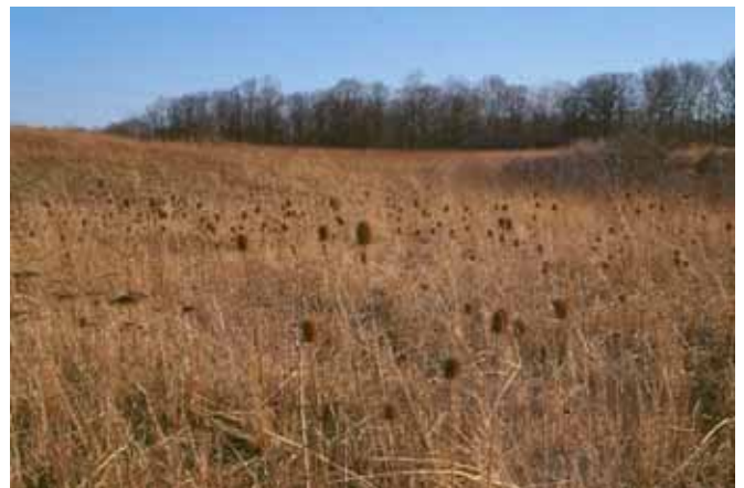
Late Winter Meadow

Spurred on I looked to the old field meadow for inspiration. I collected the seed of Black-eyed Susan, Wild Bergamot and Common Milkweed. I collected garbage bags full of Aster and Goldenrod fluff and broadcasted them with good success: New England Aster, Heath Aster and Hairy Aster; Smooth Aster on clay and Azure Aster on sand; Grey Goldenrod and Arrow-leaved Aster in rocky pastures; and Lance-leaved Aster and Grass-leaved Goldenrod in the swales.