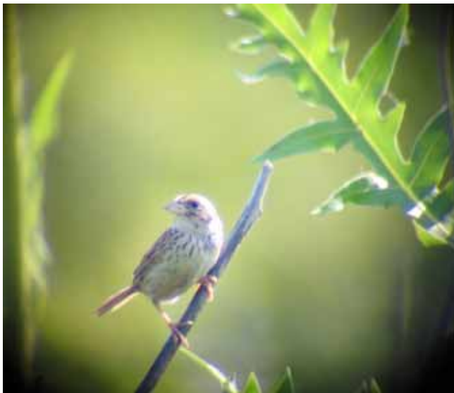
Henslow's Sparrow ( Ammodramus henslowii)

Even more exciting than the occurrence of Dickcissel is the appearance of two Henslow's Sparrow ( Ammodramus henslowii )! This diminutive and secretive species has declined drastically in most of the northeastern U.S. states where it has been known to occur. In the core of its mid-western range, it experienced severe declines. For example in the state of Illinois, Breeding Bird Survey results indicate it had declined by ~94% from 1958-1993. However since then it appears to have increased in numbers somewhat in its core range.